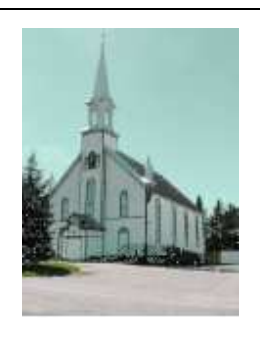
St. Malachy 3889 Route 315 Mayo, Quebec J8L 3Z8