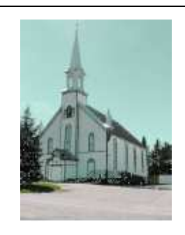
St. Malachy 3889 Route 315 Mayo, Quebec J8L 3Z8