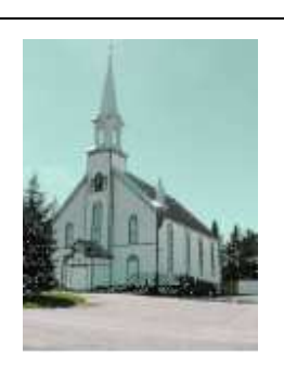
St. Malachy 3889 Route 315 Mayo, Quebec J8L 3Z8

Sunday 9:00 AM Celebration of the Eucharist Saturday 7:00 PM