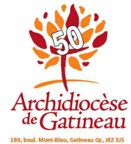
180, boul. Mont-Bleu, Gatineau Qc, J www.diocesegatineau.org