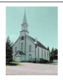
St. Malachy 3889 Route 315 Mayo, Québec J8L 3Z8