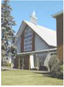
Our Lady of Victory 490 Charles Street Gatineau, Québec J8L 2K5