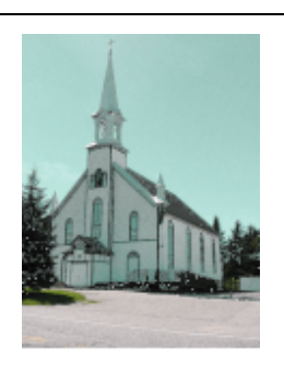
St. Malachy 3889 Route 315 Mayo, Québec J8L 3Z8