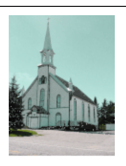
St. Malachy 3889 Route 315 Mayo, Québec J8L 3Z8