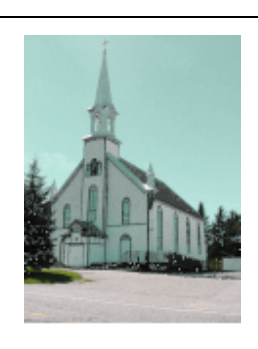
St. Malachy 3889 Route 315 Mayo, Québec J8L 3Z8

Sunday 9:00 AM Celebration of the Eucharist Saturday 7:00 PM