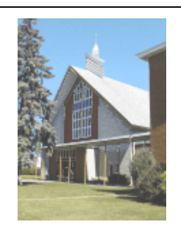
Our Lady of Victory 490 Charles Street Gatineau, Québec J8L 2K5