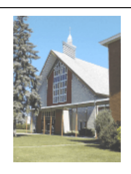
Our Lady of Victory 490 Charles Street Gatineau, Québec J8L 2K5