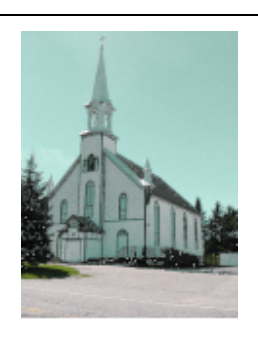
St. Malachy 3889 Route 315 Mayo, Québec J8L 3Z8

Sunday 9:00 AM Celebration of the Eucharist Saturday 7:00 PM