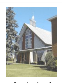
Our Lady of Victory 490 Charles Street Gatineau, Québec J8L 2K5