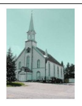
St. Malachy 3889 Route 315 Mayo, Québec J8L 3Z8