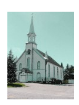
St. Malachy 3889 Route 315 Mayo, Québec J8L 3Z8

Sunday 9:00 a.m. Celebration of the Eucharist Saturday 7:00 p.m.