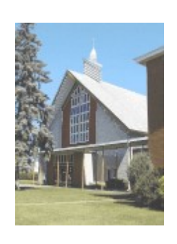
Our Lady of Victory 490 Charles Street Gatineau, Québec J8L 2K5