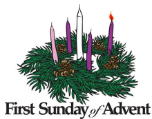
First Sunday of Advent

First Reading: Jeremiah 33.14-16 Psalm: To you, O Lord, I lift my soul Second Reading: 1 Thessalonians 3.12 - 4.2 Gospel: Luke 21.25-28, 34-36