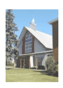
Our Lady of Victory 490 Charles Street Gatineau, Québec J8L 2K5