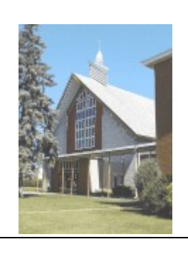
Our Lady of Victory 490 Charles Street Gatineau, Québec J8L 2K5