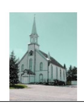
St. Malachy 3889 Route 315 Mayo, Québec J8L 3Z8