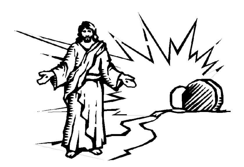
ALLELUIA JESUS IS RISEN

Thank you for continuing to pray for all those who are working to build a world of peace and justice.