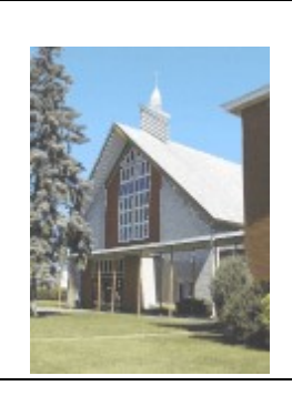
Our Lady of Victory 490 Charles Street Gatineau, Québec J8L 2K5