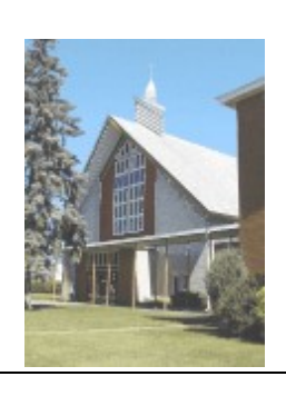
Our Lady of Victory 490 Charles Street Gatineau, Québec J8L 2K5