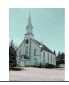
St. Malachy 3889 Route 315 Mayo, Québec J8L 3Z8