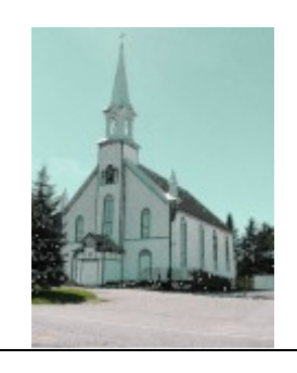
St. Malachy 3889 Route 315 Mayo, Québec J8L 3Z8