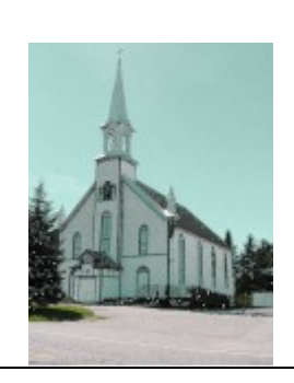
St. Malachy 3889 Route 315 Mayo, Québec J8L 3Z8