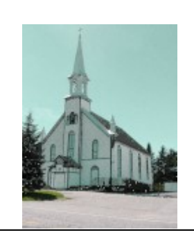
St. Malachy 3889 Route 315 Mayo, Québec J8L 3Z8