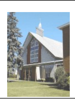
Our Lady of Victory 490 Charles Street Gatineau, Québec J8L 2K5