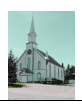
St. Malachy 3889 Route 315 Mayo, Québec J8L 3Z8