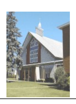
Our Lady of Victory 490 Charles Street Gatineau, Québec J8L 2K5