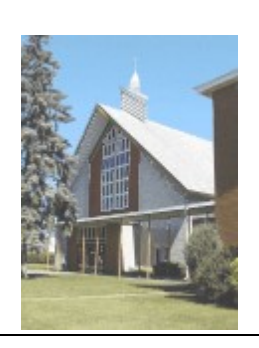
Our Lady of Victory 490 Charles Street Gatineau, Québec J8L 2K5