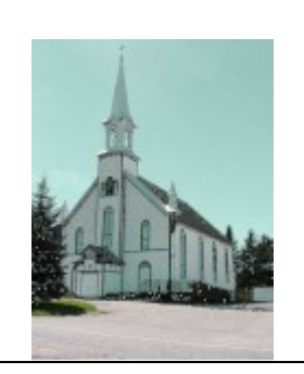
St. Malachy 3889 Route 315 Mayo, Québec J8L 3Z8