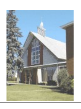
Our Lady of Victory 490 Charles Street Gatineau, Québec J8L 2K5