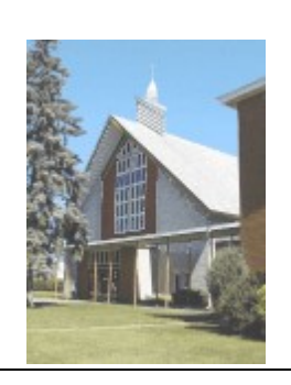
Our Lady of Victory 490 Charles Street Gatineau, Québec J8L 2K5