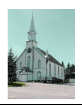
St. Malachy 3889 Route 315 Mayo, Québec J8L 3Z8

MAY 25-26, 2024 Celebration of the Eucharist