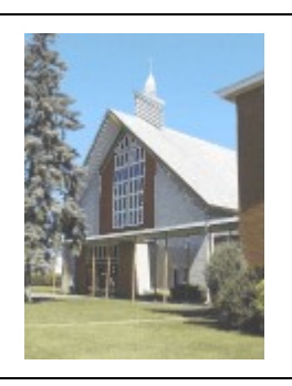
Our Lady of Victory 490 Charles Street Gatineau, Québec J8L 2K5